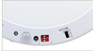
Selectable Wattage Switch and Integrated Occupancy/Photo cell Sensor Shown